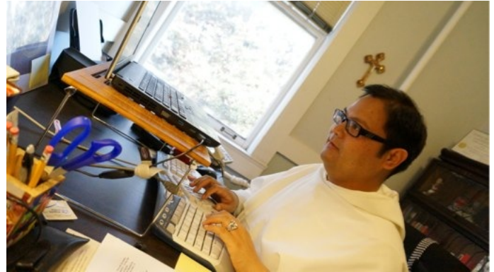
Evangelizing through social media